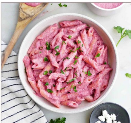
Creamy Beet Pasta