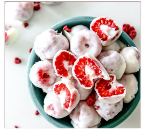
Yogurt Covered Berries